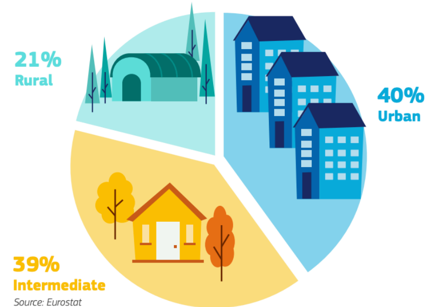
EU-27 population by urban-rural regional typology, 2019