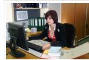
Fields of activity