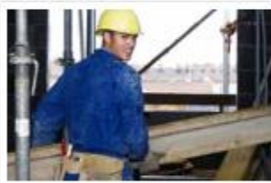
Occupations from A to Z

Various access paths will help you find interesting contents: