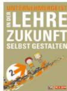
Info-Broschüre für Lehrlinge: Zukunft selbst gestalten