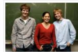
Education and Training