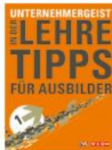
Broschüre: Tipps für Ausbilder