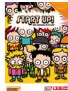
Computerspiel: Start Up – Vom Lehrling zum Chef