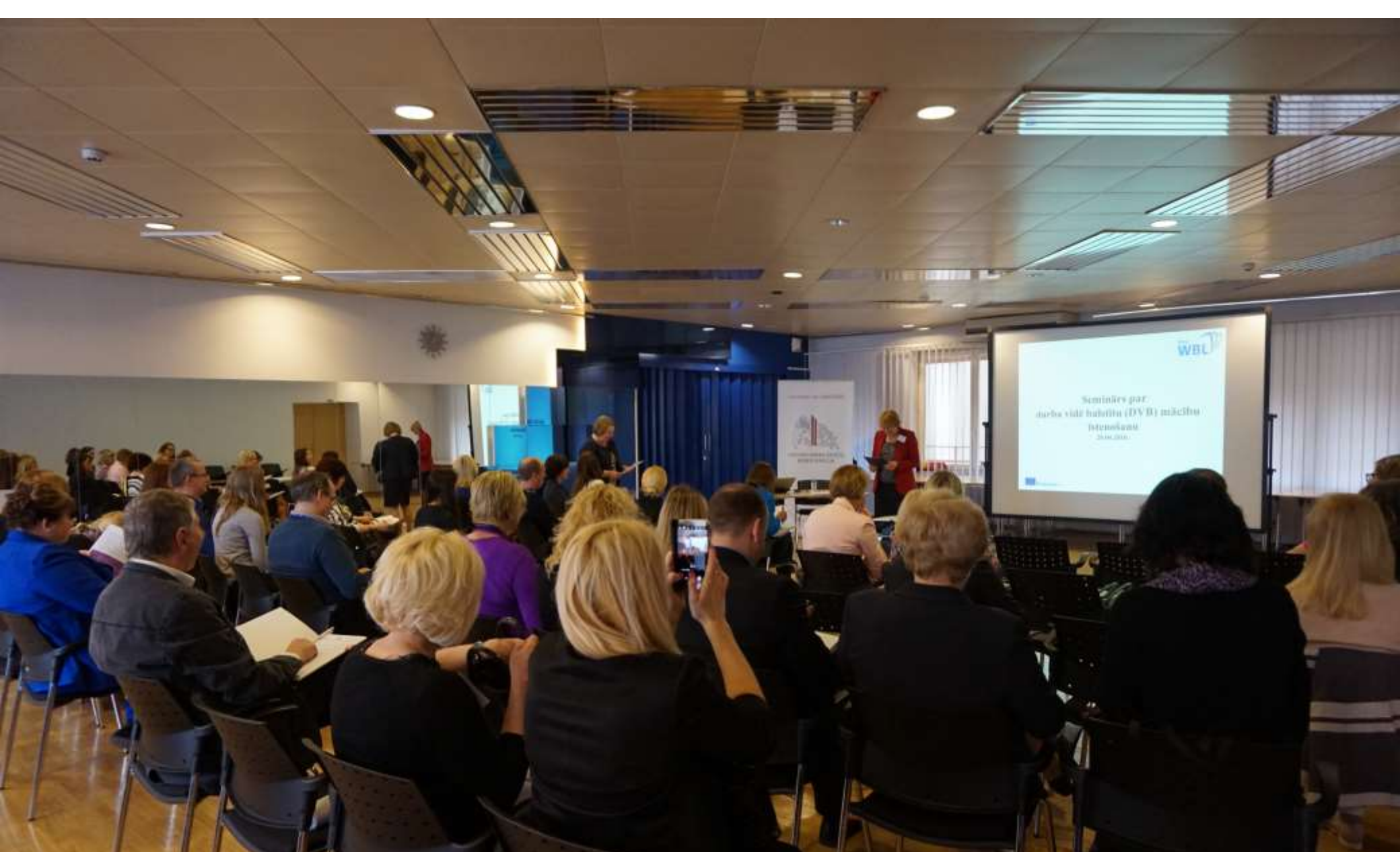
Seminar on Work Based Learning, Riga 2016