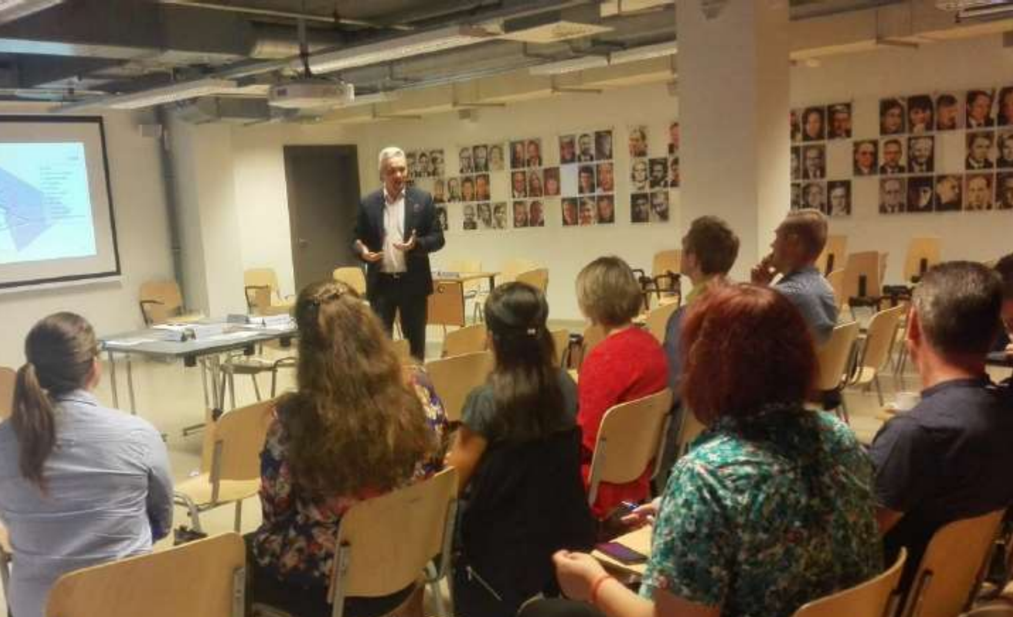
Training Course on business process simulation, Riga 2015