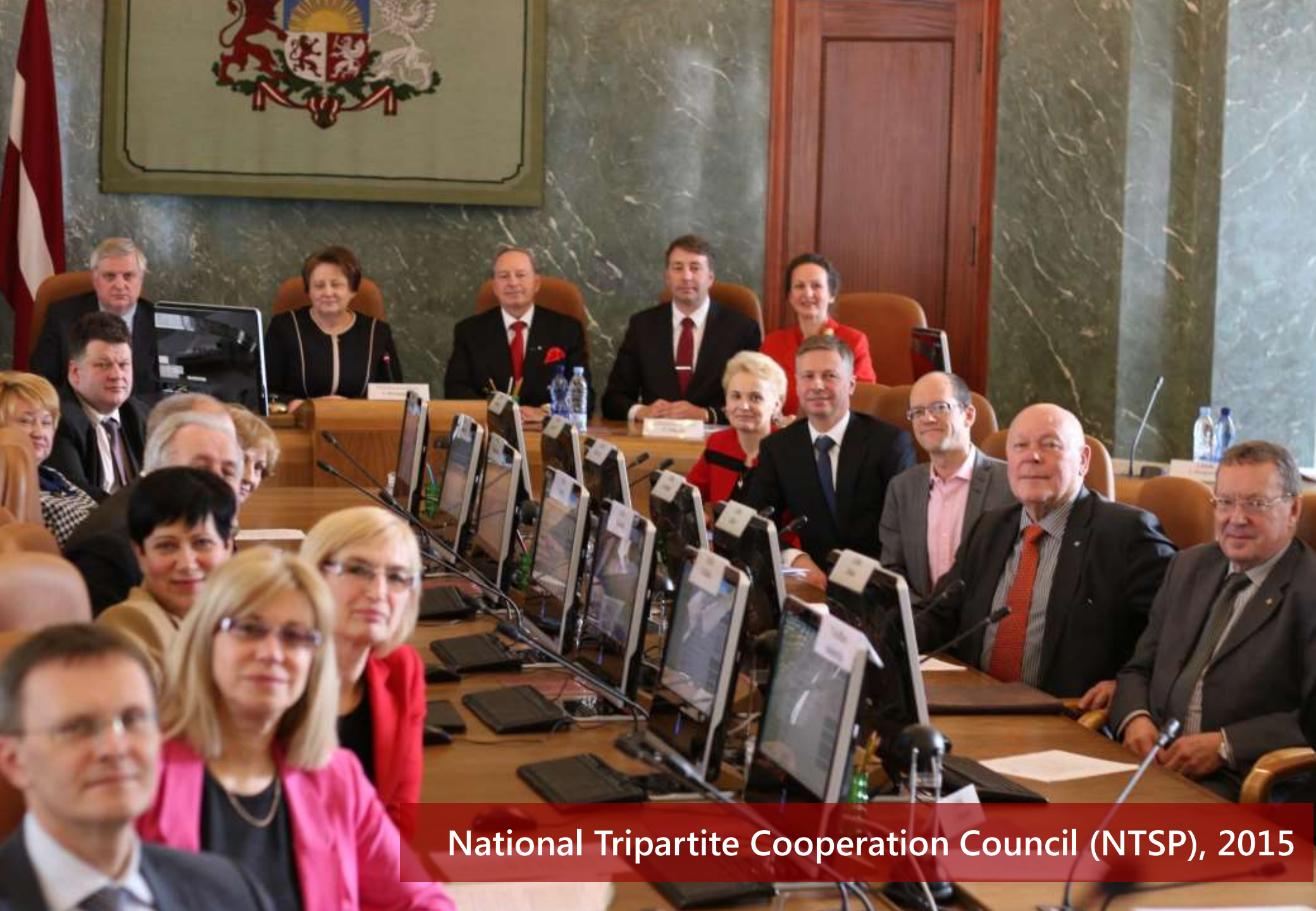
National Tripartite Cooperation Council (NTSP), 2015