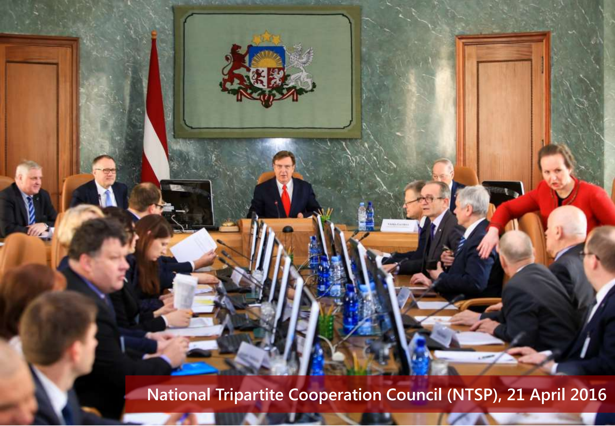
National Tripartite Cooperation Council (NTSP), 21 April 2016